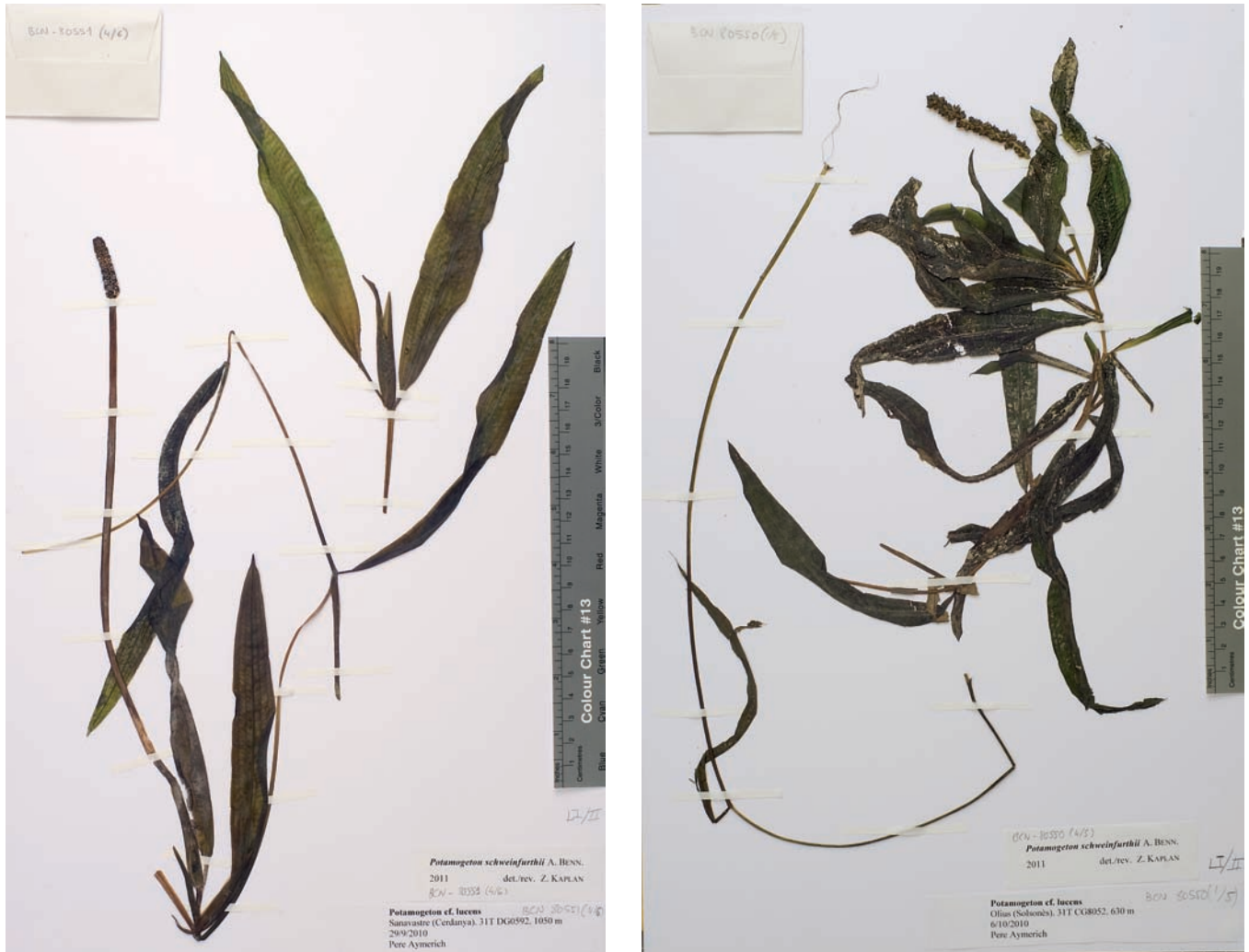
Fig. 2. Potamogeton schweinfurthii . Two specimens recently collected in NE Spain (BCN 80550, BCN 80551. See Table 1).

to date indicates that P. schweinfurthii is very rare in the Peninsula. The absence of P. schweinfurthii in the revised vouchers from the NE Iberian Peninsula support this view, as does the fact that in a recent survey of 262 water bodies in Central Catalonia, P. schweinfurthii was located in solely two, that is only in 0.76% of the localities surveyed (Aymerich, unpublished data). This frequency is almost identical to the proportion (0.77%) of specimens of P. schweinfurthii recognized by Kaplan (2005) after reviewing 1,300 vouchers of Potamogeton from the Mediterranean Europe.