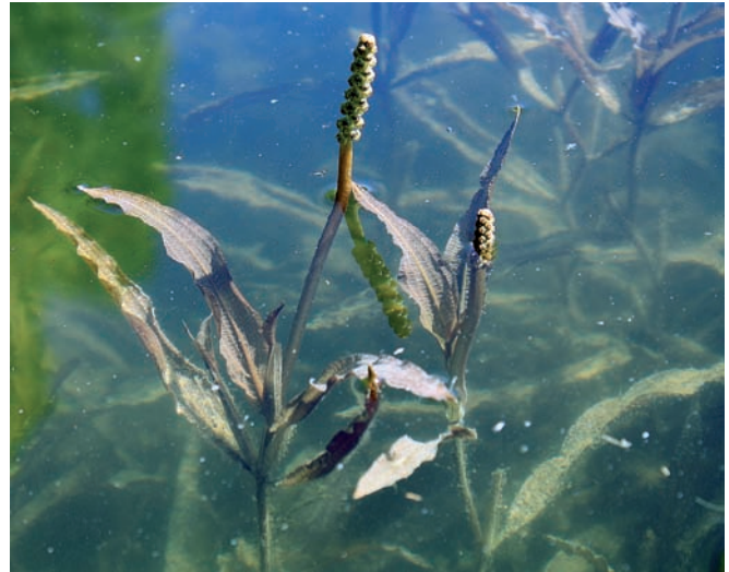
Fig. 3. Potamogeton schweinfurthii . Sanavastre pond, Das, Girona, Catalonia, September 2011.

-16°C. Moreover, plants of P. schweinfurthii from Kenya, Italy and Portugal have been grown for several years in outdoor cultivation tanks in the experimental garden at the Institute of Botany, Průhonice, Czech Republic. They have experienced an even colder climate there. The average temperatures recorded for this region, Central Bohemia, were -4.7°C in January 2010 and -4.7°C in December 2010 ( http://portal.chmi.cz ), with minimum temperatures occasionally reaching as low as about -25°C. All plants of P. schweinfurthii , regardless of its origin, successfully survived all winters under an ice cover. Even though hydrophytes are known to tolerate a wide range of temperatures thanks to the insulating effect of water, it is still surprising that a species that has been considered tropical or subtropical has adapted to an area where there is frost for a significant part of the year. Bearing in mind this tolerance to frost, and its probable dissemination by birds, we consider it is likely that populations of P. schweinfurthii will be detected in non-Mediterranean European areas.