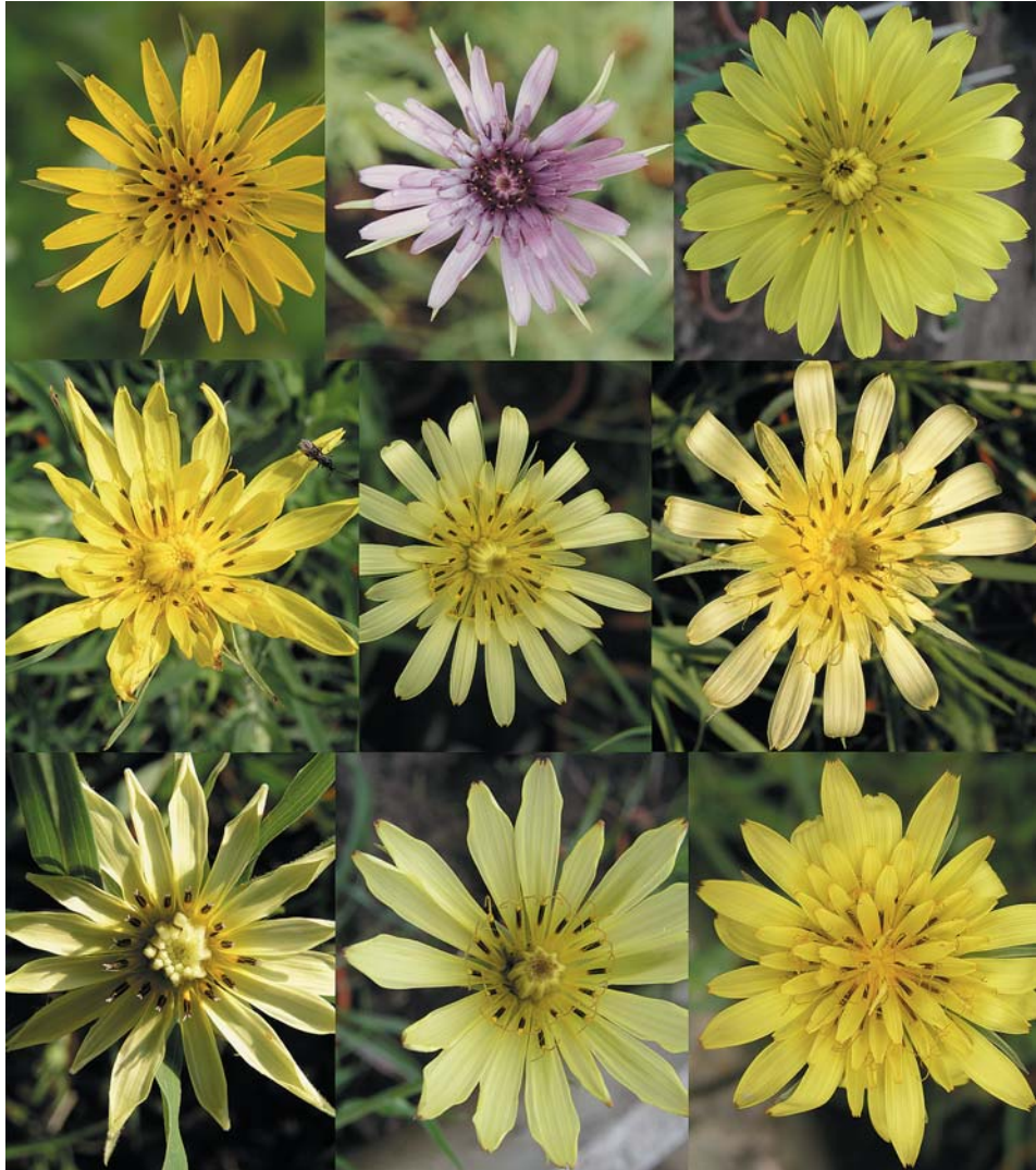
Fig. 1. – Capitula of Tragopogon taxa studied: T. pratensis (upper row, left; Planá u Mariánských Lázní), T. porrifolius subsp. porrifolius (upper row, middle; garden culture), and individuals from hybrid population of T. xmirabilis in Roudnice nad Labem.

the top of stonewalls. One of the typical habitats is at the base of walls, fences etc. The most distant occurrence was along the road from Roudnice to the highway, i. e. some distance from the ruderal places in the town. The detailed distribution is given on Fig. 4.