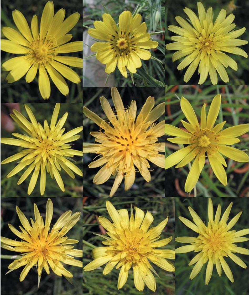
Fig. 2. – Capitula of Tragopogon xmirabilis from Roudnice nad Labem.