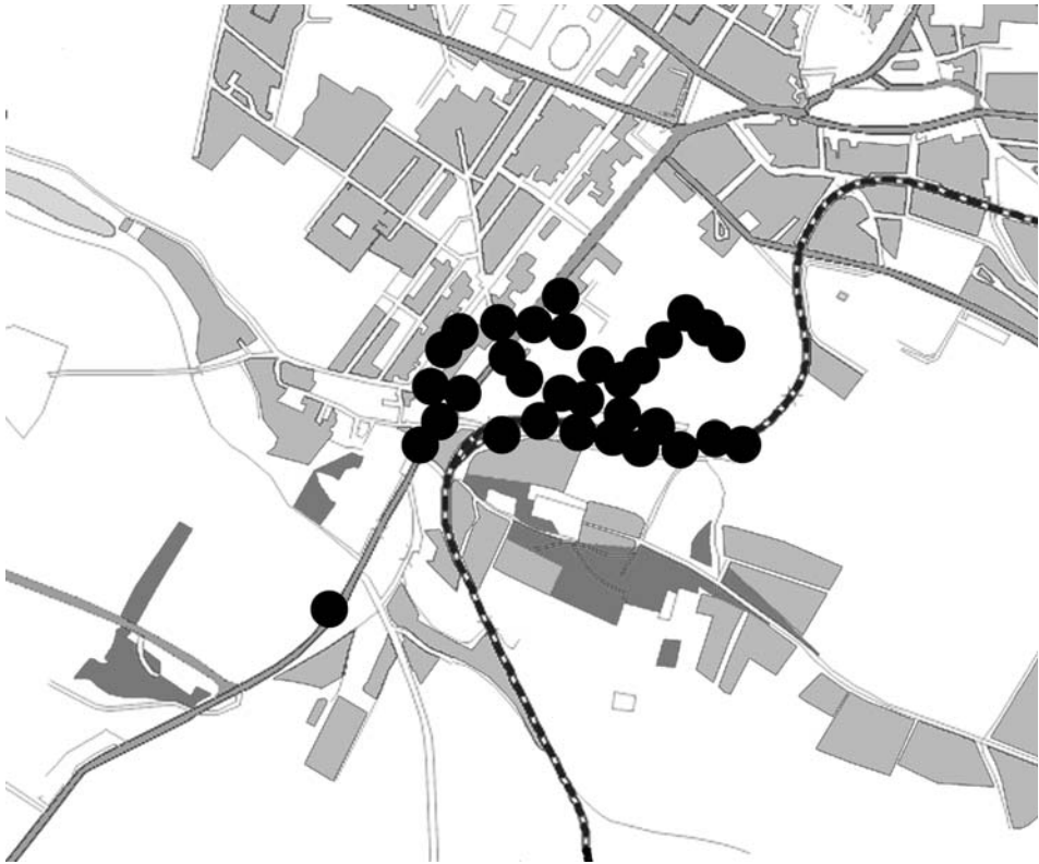
Fig. 4. – Distribution of Tragopogon xmirabilis in SW part of the town of Roudnice nad Labem.

involucral bracts and coloration of anther tubes. Polycarpic perennality is a new character for Tragopogon in Central Europe. More than 800 plants grown from seed collected at this locality were perennials, forming new shoots on the root heads. None of the hundreds of T. pratensis plants in populations in western Bohemia, the area with richest population of this species in the Czech Republic, were perennial. We do not think it is a character, which appeared de novo in the hybrid plants. We think it is a reversal to the primary condition. This opinion is based on the fact that there are some perennial Tragopogon species such as T. ruber S. G. Gmelin, T. marginifolius Pawłowski, T. kotschyi Boiss., T. montanus S. Nikitin and T. albinerve Freyn et Sint. The last three species were found to be the most primitive ones of Tragopogon in the phylogenetic analysis of the subtribe Scorzonerinae published by Mavrodiev et al. (2004: Fig. 5). The biennial life history (it is better to speak about monocarpic perennials, see also Qi et al. 1996) appeared independently at least two times within this subtribe, annuals at least three times. Based on the present knowledge one can only speculate about the advantages of the perennial life history for the plants in Roudnice. The richest population was at the train station, a habitat that is often occupied by annuals and biennials (as Oenothera sp., Berteroa incana , Daucus carota ).