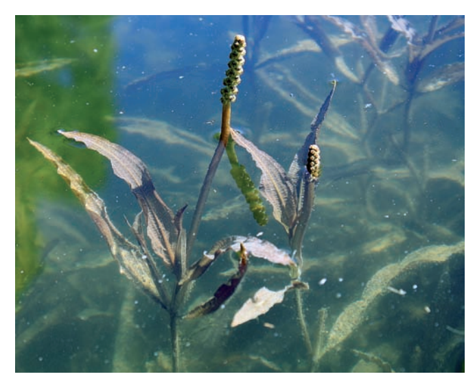
Fig. 3. Potamogeton schweinfurthii . Sanavastre pond, Das, Girona, Catalonia, September 2011.

-16 °C. Moreover, plants of P. schweinfurthii from Kenya, Italy and Portugal have been grown for several years in outdoor cultivation tanks in the experimental garden at the Institute of Botany, Průhonice, Czech Republic. They have experienced an even colder climate there. The average temperatures recorded for this region, Central Bohemia, were -4.7 °C in January 2010 and -4.7 °C in December 2010 (http://portal. chmi.cz), with minimum temperatures occasionally reaching as low as about -25 °C. All plants of P. schweinfurthii, regardless of its origin, successfully survived all winters under an ice cover. Even though hydrophytes are known to tolerate a wide range of temperatures thanks to the insulating effect of water, it is still surprising that a species that has been considered tropical or subtropical has adapted to an area where there is frost for a significant part of the year. Bearing in mind this tolerance to frost, and its probable dissemination by birds, we consider it is likely that populations of P. schweinfurthii will be detected in non-Mediterranean European areas.