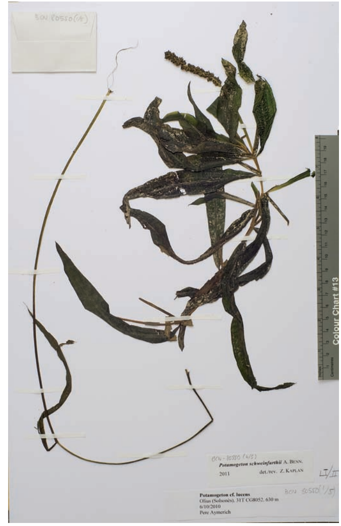
Fig. 2. Potamogeton schweinfurthii. Two specimens recently collected in NE Spain (BCN 80550, BCN 80551. See Table 1).

to date indicates that P. schweinfurthii is very rare in the Peninsula. The absence of P. schweinfurthii in the revised vouchers from the NE Iberian Peninsula support this view, as does the fact that in a recent survey of 262 water bodies in Central Catalonia, P. schweinfurthii was located in solely two, that is only in 0.76% of the localities surveyed (Aymerich, unpublished data). This frequency is almost identical to the proportion (0.77%) of specimens of P. schweinfurthii recognized by Kaplan (2005) after reviewing 1,300 vouchers of Potamogeton from the Mediterranean Europe.