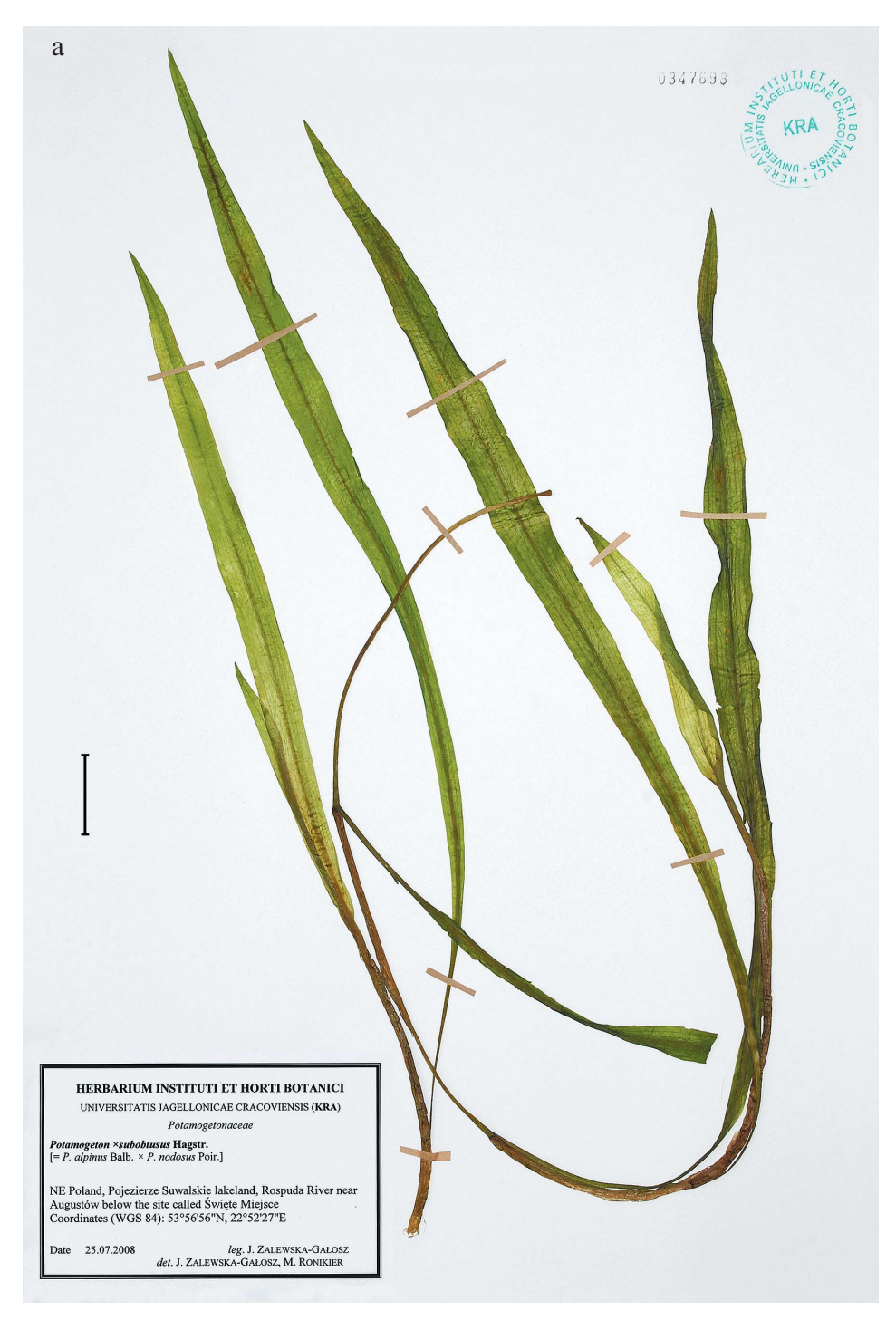
Fig. 1. – Potamogeton \times subobtusus from the river Rospuda, Poland; a – specimen with only submerged leaves, b – specimen with floating and submerged leaves; scale bar = 1 cm.